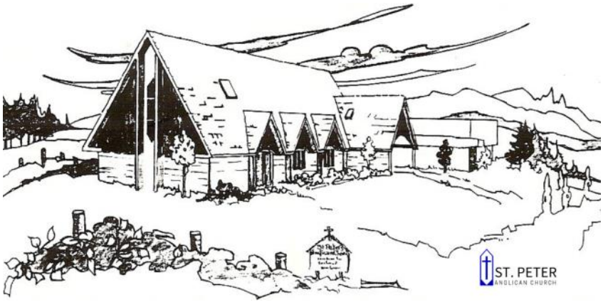
St. Peters Anglican Church Campbellton - Built 1931